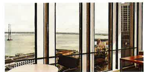
EMBARCADERO Four Embarcadero Center | Suite 1400 San Francisco, CA