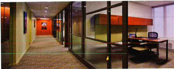
AON 200 East Randolph Street | Suite 5100 Chicago, IL