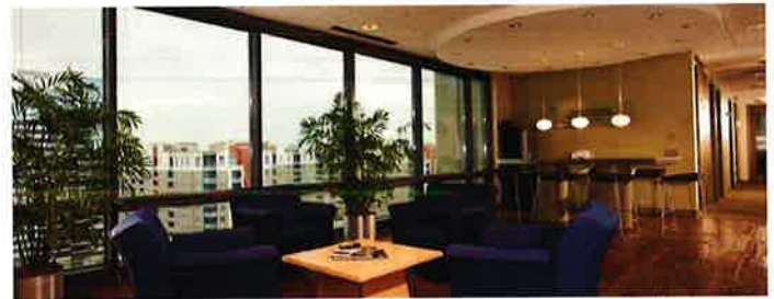
LAS OLAS 401 East Las Olas Boulevard | Suite 1400 Fort Lauderdale, FL