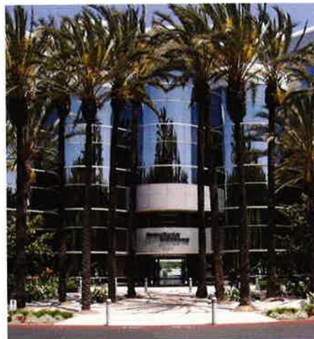
LAGUNA NIGUEL 28202 Cabot Road | Suite 300 Laguna Niguel, CA