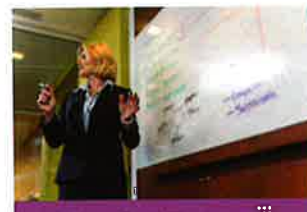
Meeting Rooms & Events Spaces

A variety of collaborative areas and offices with flexible terms are available immediately and make the perfect space for your growing business.