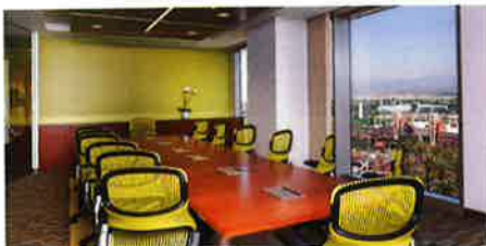
IRVINE SPECTRUM 100 Spectrum Center Drive | Suite 900 Irvine, CA