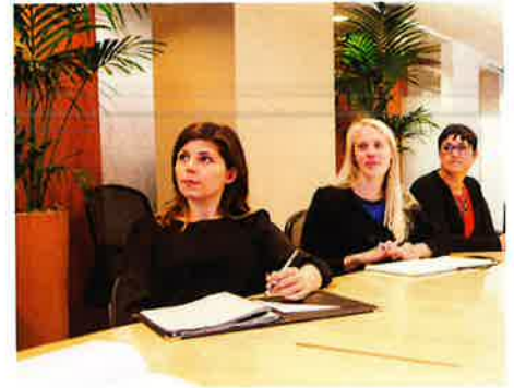
TEN POST OFFICE SQUARE Ten Post Office Square | Suite 800 Boston, MA