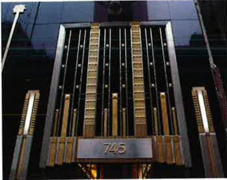
745 FIFTH AVENUE 745 Fifth Avenue | Suite 500 New York, NY