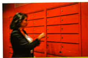
Mailing Address & Phone Service

Drop in to our café and have a seat. Work for up to three hours a day during business hours with access to business support services.